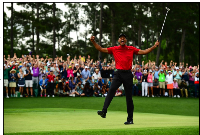
Tiger Woods celebrates after sinking his putt on the 18th green, officially winning the Master's at Augusta last Sunday.

683 - Total weeks Woods has spent as the worlds best golfer (most of anyone ever).